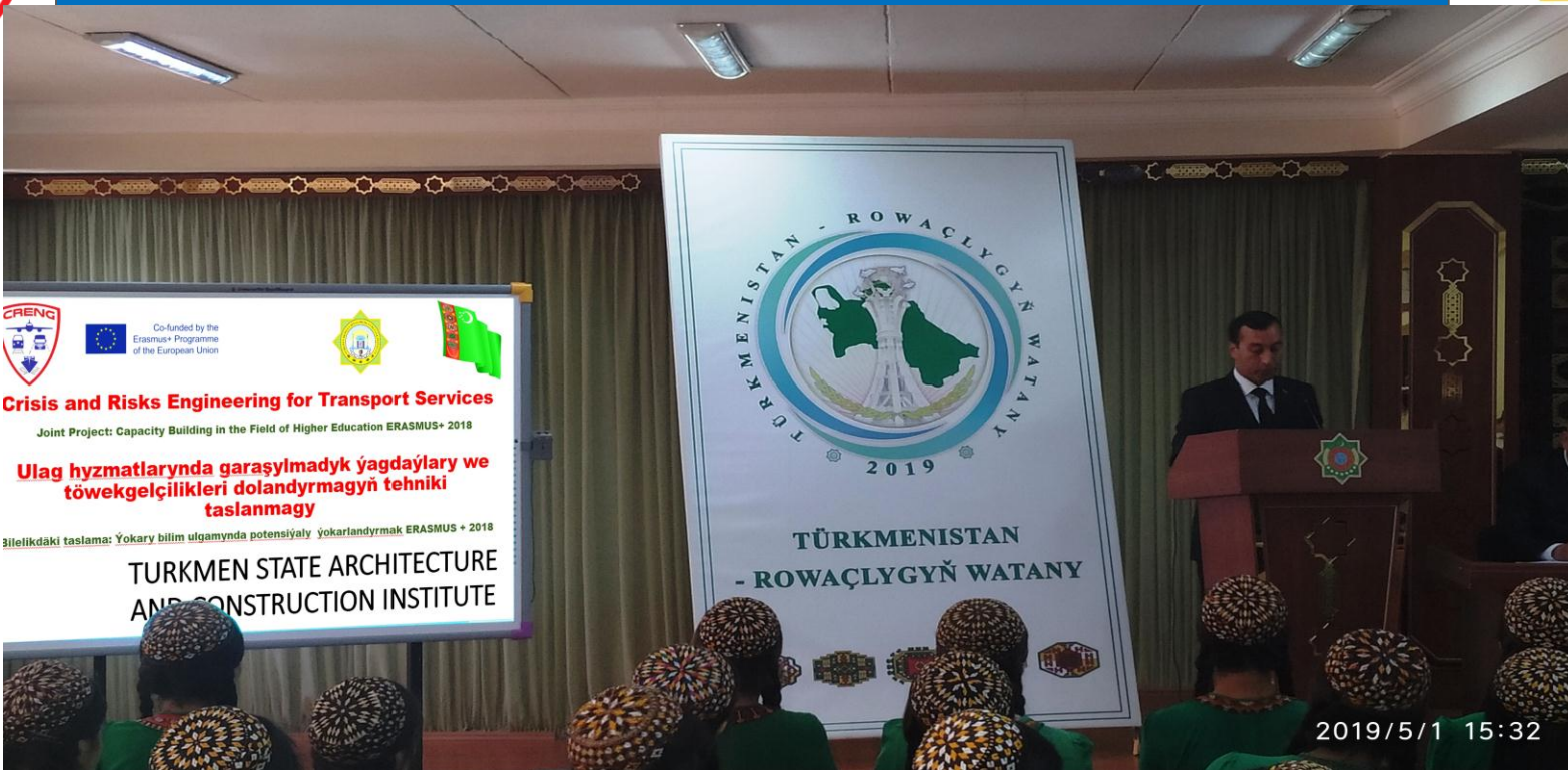
Open Day. Meetings of schoolchildren with employees of the institute were held: Y. Myradov talks about international projects.